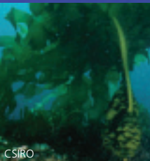
CSIRO Wakame (Japanese kelp) Undaria pinnatifida