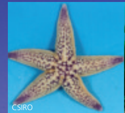
CSIRO Northern Pacific seastar Asterias amurensis